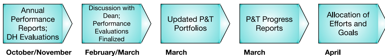
Figure 2: Overview of Timeline

All parties involved in the evaluation process are expected to strive to provide a fair and impartial assessment that builds on the criteria set by the Department, College and University policies. The College understands that each faculty member is unique in her/his skills and expertise, and it is expected that the candidate provides adequate documentation to demonstrate professional stature, performance and impact in all areas being assessed. The adequacy of the documentation should be assessed according to the metrics and expectations set in the Departmental Functions and Criteria Statement, the College and NMSU policies. The candidate's level of ability in these areas should be consistent with the rank or tenure status being sought. Academic excellence is expected in all areas of performance. In addition, the College also values the demonstration of collegiality, collaborative work and teamwork – each faculty member is encouraged to pursue and properly document collaborative efforts.